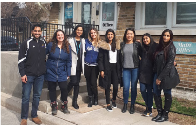
Klick Health dropping off Mother's Day gifts

We were blown away by the generosity of our community in donating Mother's Day gifts for the young moms at our centre. For many of the young moms who live here, this was their first Mother's Day and they really appreciated being recognized and celebrated. Thank you Klick Health, the Shoebox Project, Branksome Hall Parents Association, The Donway Covenant United Church, and everyone else who helped make Mother's Day a really special day for all of our families.