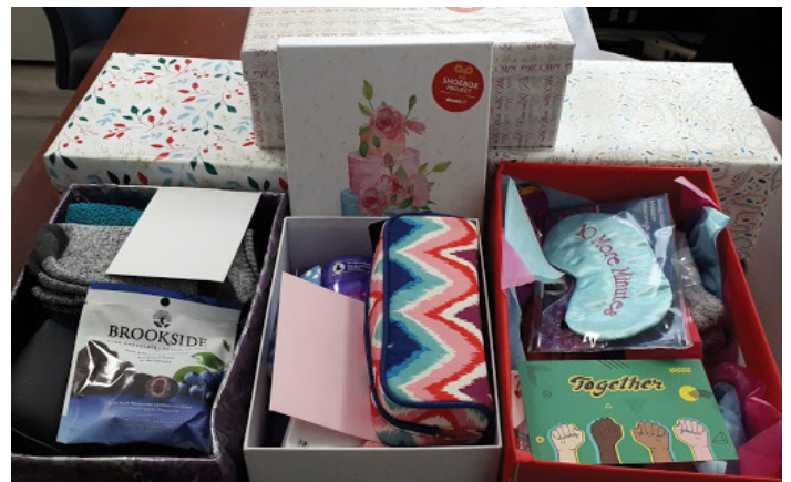
The Shoebox Project gifts for the young moms